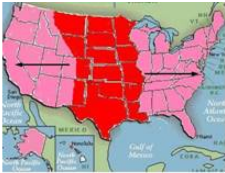
Coyote dispersal range

Coyotes are originally native to California and several other western states. Due to their intelligence, adaptability, the decline of larger animals and urban sprawl, coyotes have successfully expanded their range. They are now found in all states except Hawaii and have successfully established themselves in every urban ecosystem across North America.