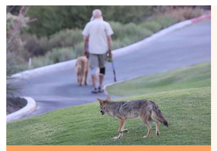
Coyote keeping an eye on dog walkers passing through their territory